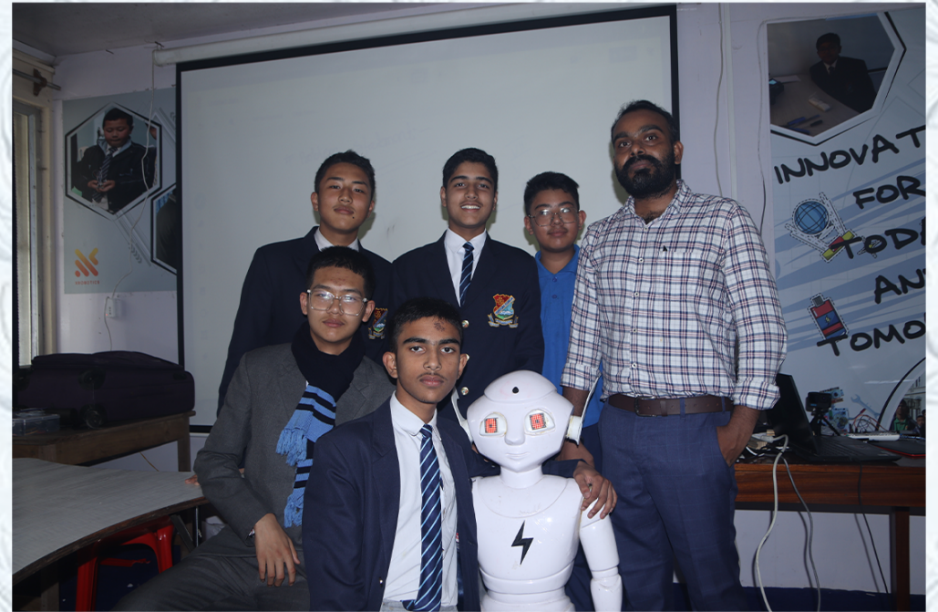
Group picture with the future