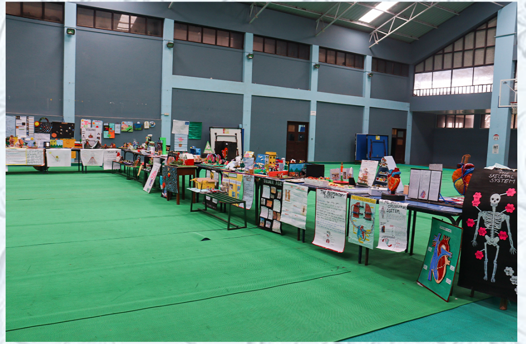
Display of the exhibits