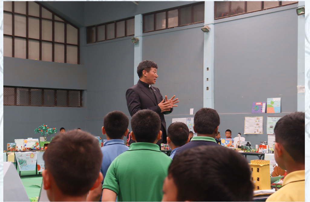
Fr. Prefect addressing the PD boys