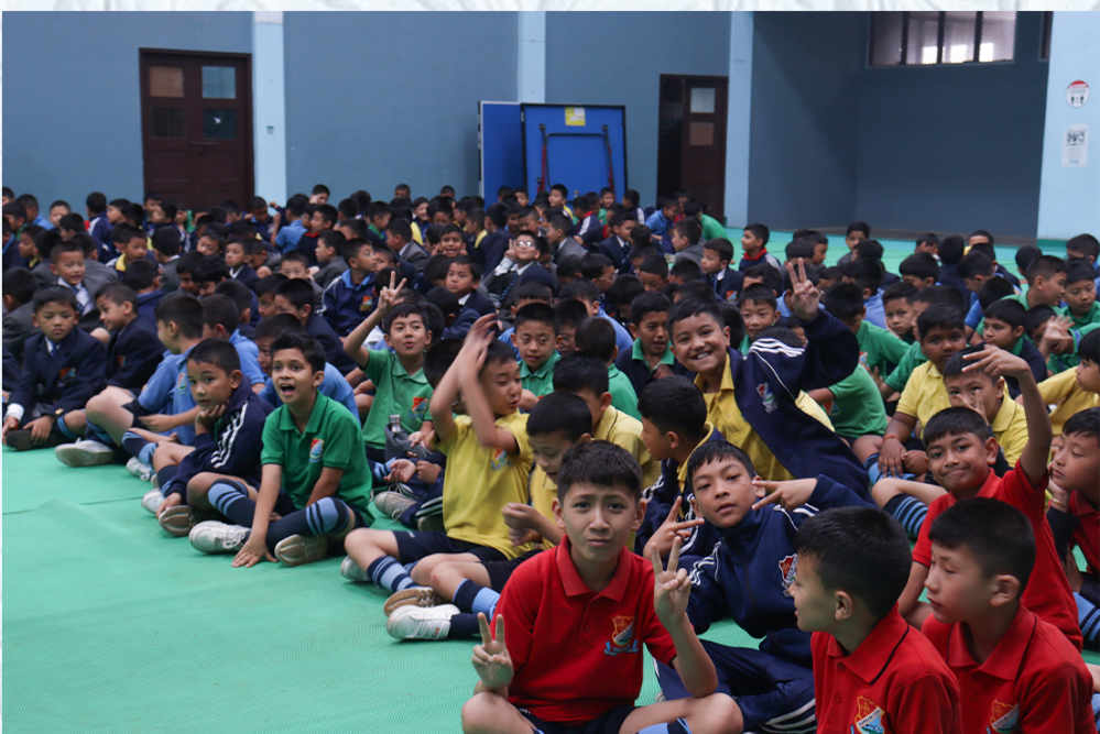
The scientific future of North Point