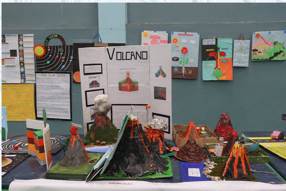
Eruption of science