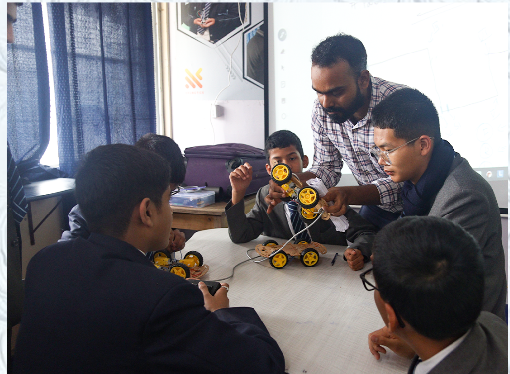
From concept to creation