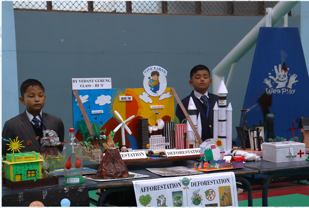
The guards of science