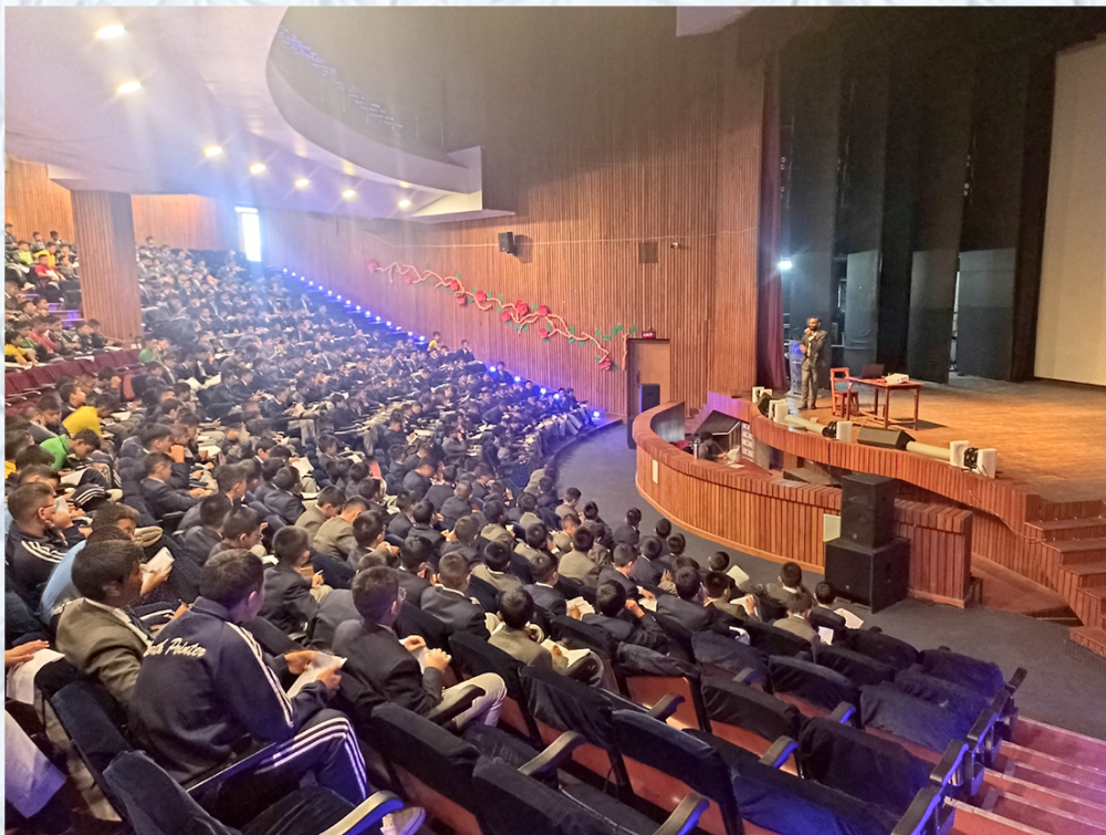
Briefing on the importance of robotics